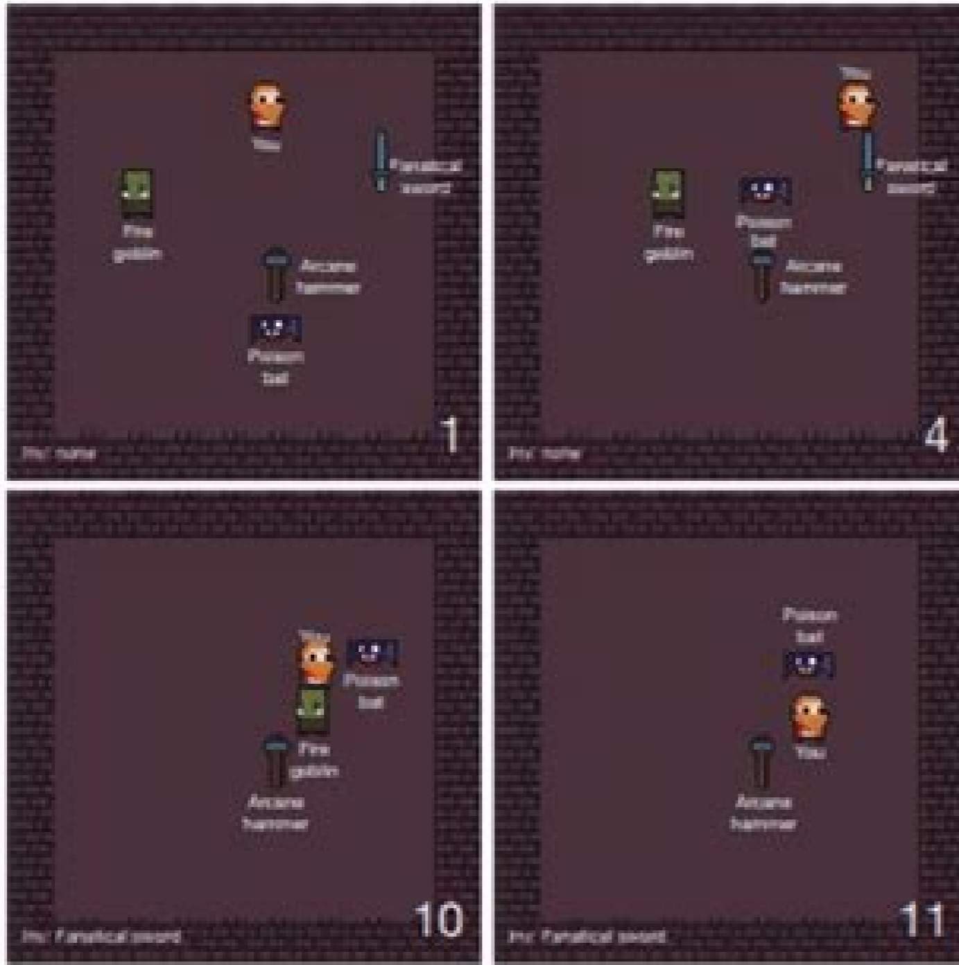
Darkest dungeon viet hoa.

Doc: The Rebel Enclave consists of jackal, spider, and warg. Arcane, blessed items are useful for poison monsters. Star Alliance contains bat, panther, and wolf. Goblin, jaguar, and lynx are on the same team - they are in the Order of the Forest. Gleaming and mysterious weapons beat cold monsters. Lightning monsters are weak against Grandmaster's and Soldier's weapons. Fire monsters are defeated by fanatical and shimmering weapons. Goal: Defeat the Order of the Forest